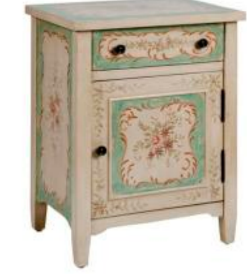
Hand-painted floral accent table, $150-$180, is part of its new collection for QVC