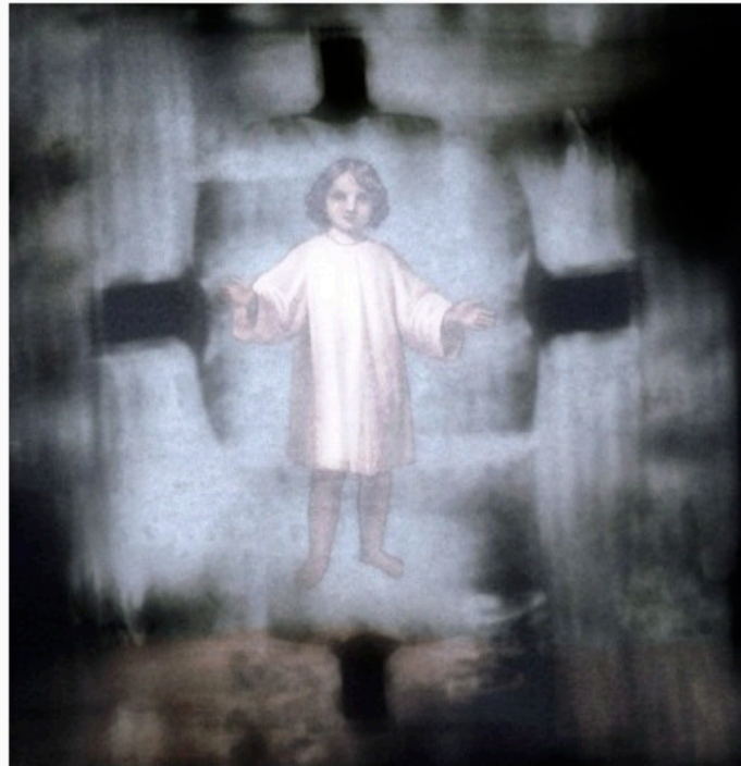
"Baptism for the Abandoned Child," Susan Goldstein.