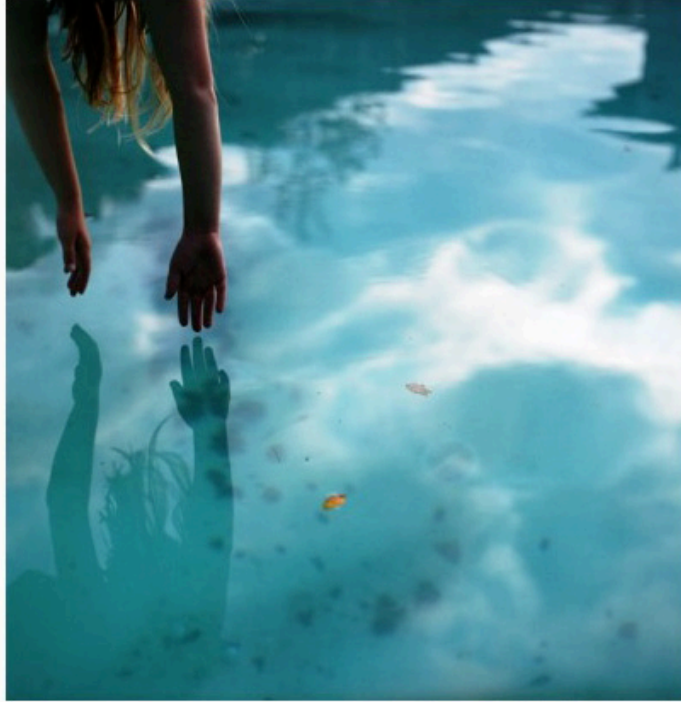
"Suspended," Rebekah Rocha.