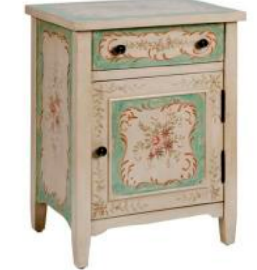
Hand-painted floral accent table, $150-$180, is part of its new collection for QVC